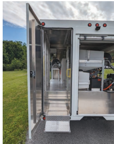
REAR ENTRY DOOR WITH SAFE, EASY ACCESS