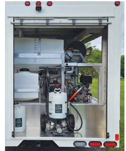
REAR DROP DOWN AREA FOR EXTRA STORAGE